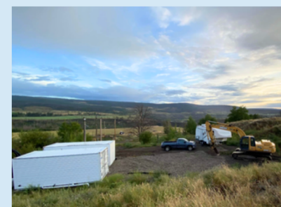
TNG’s new Conservation Hatchery Manager Wayne Levesque snapped this photo at the hatchery site last night (Tuesday). We’re now conducting systems testing and training, and are on track for full operation including egg incubation and rearing by September 2023.