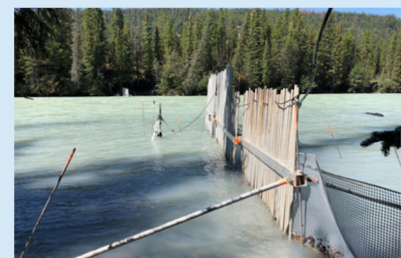
Taseko SONAR installation was completed today (Wednesday) to count vulnerable Taseko Ts’eman.