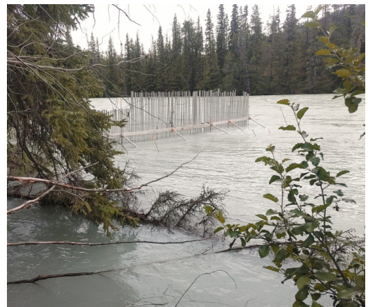
Photos: TNG Fisheries crew installing the SONAR system in the Taseko River to count vulnerable Taseko Ts'eman (sockeye).