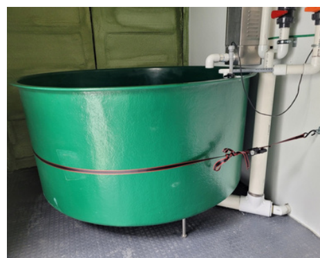
Rearing tank inside the hatchery.