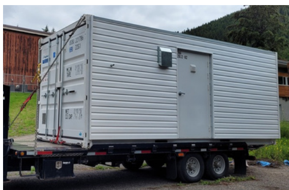
Hatchery delivery to TNG.

The T̓silhqot̓'in conservation hatchery has been delivered and is currently at the TNG South Lakeside office going through plumbing and electrical finishing work prior to installation at the Hanceville site.