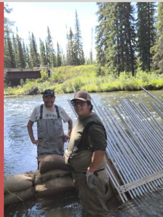
Photo: Setting up the Upper Chilcotin brood capture fence for Big Bar Landslide emergency enhancement.

Brood capture for Upper Chilcotin emergency enhancement was successful, with 4 females and 6 males captured