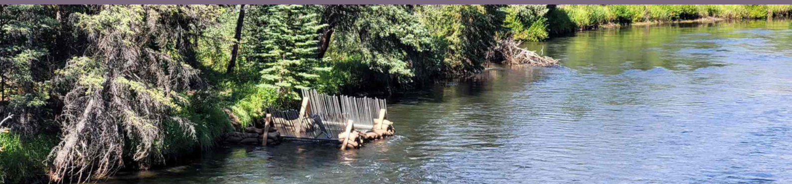
Photo: Upper Chilcotin brood capture fence for Big Bar Landslide emergency enhancement.

The latest information important to T̓silhqot̓in fish and fishing activities